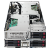
HPE ProLiant XL250a Gen9 Server