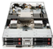
HPE ProLiant XL260a Gen9 Server