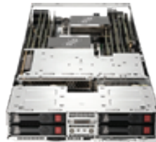
HPE ProLiant XL230a Gen9 Server