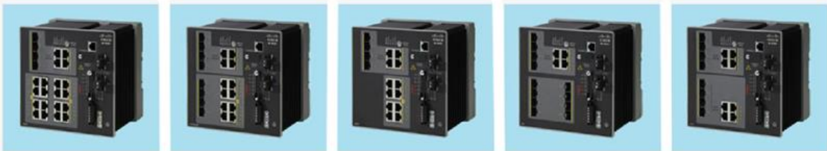
Figure 1. IE 4000 models

Figure 1 shows the switch models, Table 2 lists all the available Cisco IE 4000 Series models, Table 3 lists the power supplies for Cisco IE 4000 Series Switches.